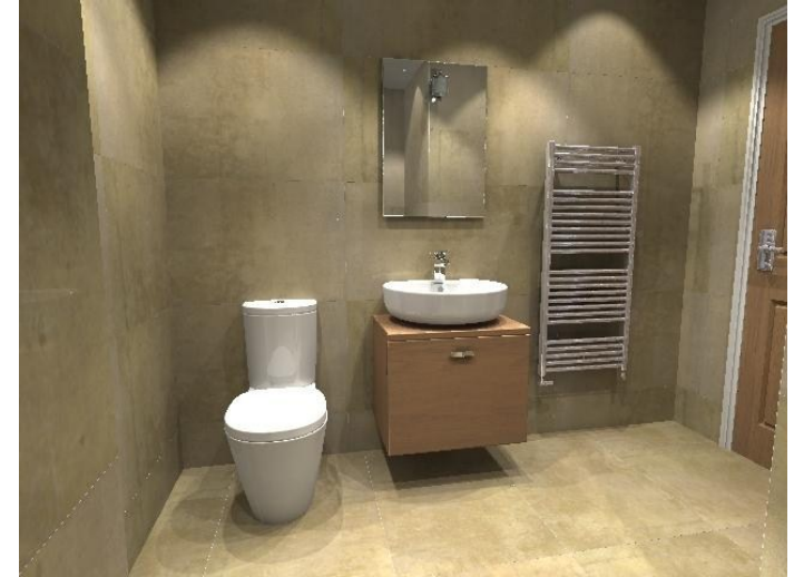
Master Bedroom Ensuite