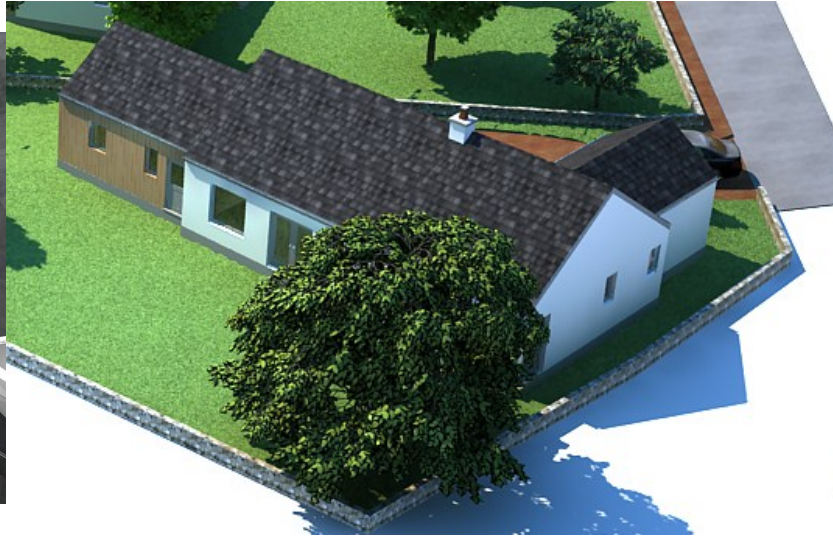
View to rear of house