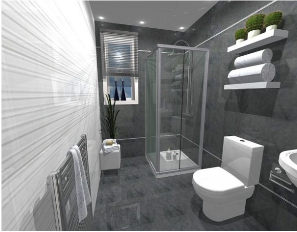
Main Shower Room